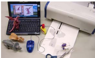
The fusion of the analog and the digital style.