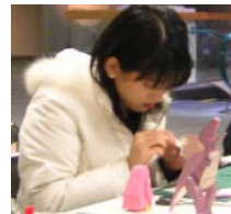
Print & Handicraft