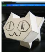
It is made to complete a model in the PC screen.